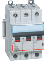
4 080 87