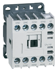
4 168 10

Technical characteristics p. 188 Dimensions see e-catalogue